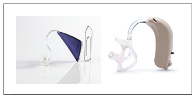
Figure 1: A RITE-style mini BTE compared to a traditionally styled BTE.

In some cases, the difference between a traditionally styled BTE and a mini is the absence of switches, push buttons or