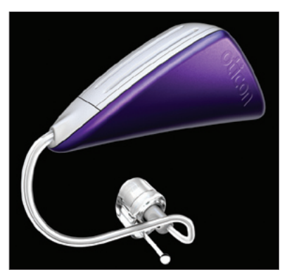
Figure 3: A custom canal-style mold connected to a RITE-style mini BTE.

BTEs can offer improved cosmetics, especially when connected to thin tubes or when implemented as a RITE design.