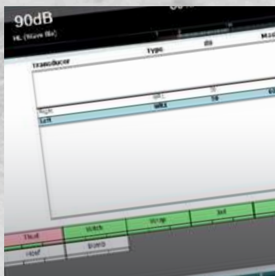
Speech test available in both table and graphic mode