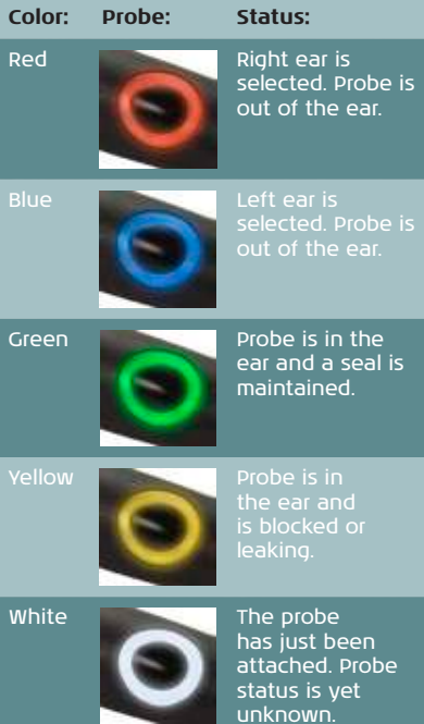
Probe status displayed on diagnostic probe / shoulder box for clinical probe