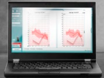
Visible Speech Mapping