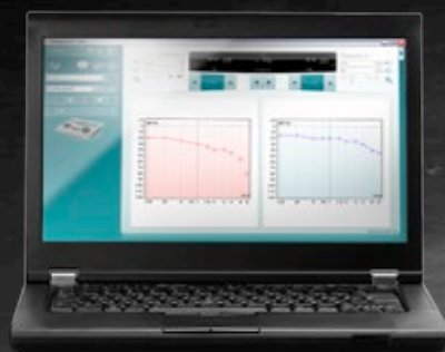
Diagnostic Suite software (AS608e only)