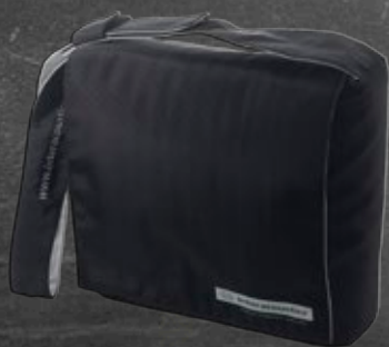
The soft carrying case

The AS608 / AS608e will operate with 3 standard AA batteries or a medically approved external power supply. Typical battery life is six months.